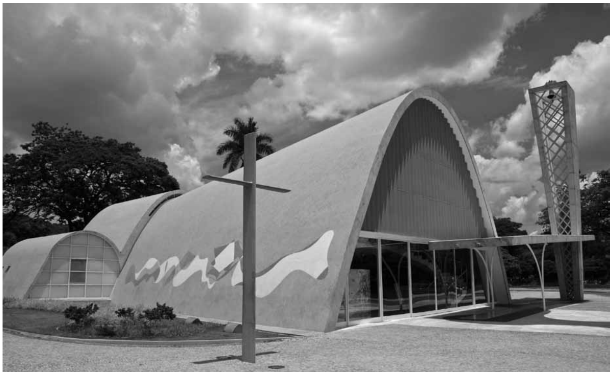
3 Oscar Niemeyer, Church of São Francisco de Assis, Pampulha, Belo Horizonte, Minas Gerais, 1940–42: view of lakeside (east) elevation