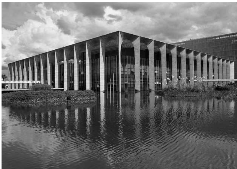
12 Palácio do Itamaraty, originally named Palácio dos Arcos (Ministry of Foreign Affairs), Brasília, 1962–70: view of the main pavilion set in a pool landscaped by Roberto Burle Marx