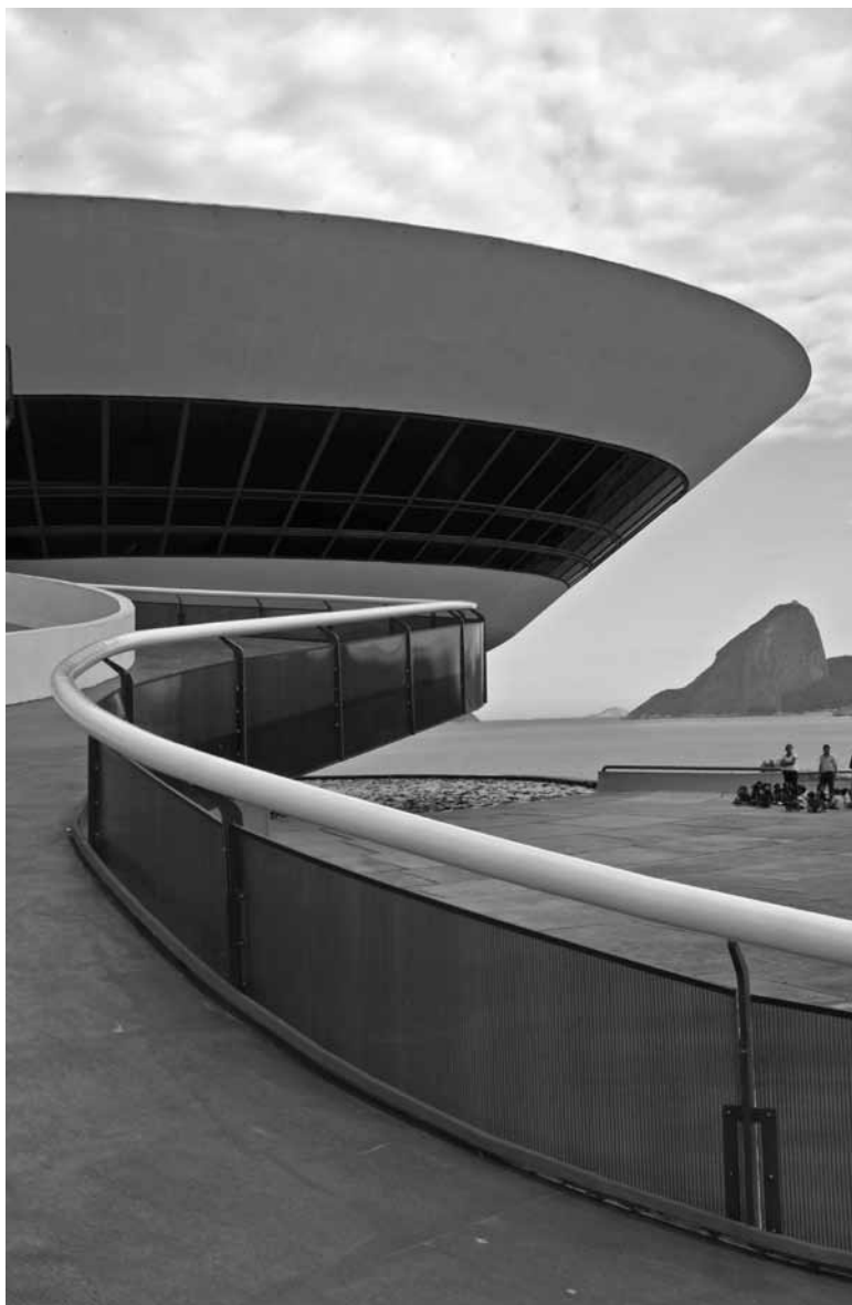
13 Museu de Arte Contemporânea, Niterói, Rio de Janeiro state, 1991–96

advanced Brazilian engineering and Europe's technology and skilled labour force to produce buildings that were both aesthetically challenging and structurally daring. The precisely-patterned exposed-concrete arcades of the Mondadori headquarters in Segrate, near Milan (1968–75) resemble those of Brasília's Palácio do Itamaraty (Ministry of Foreign Affairs, 1962–70) [12] but, at Segrate, Niemeyer incorporated a random aspect into the design. On each elevation, the twenty-two parabolic arches of variable width and curvature are united by a single parametric equation. Niemeyer's 'modern version of the Greek temple' ranks among his greatest achievements.