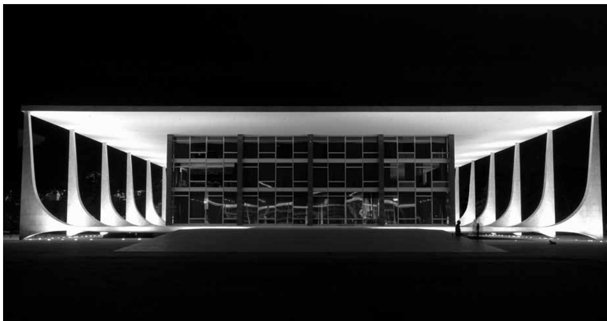
11 Supremo Tribunal Federal (Supreme Court), Praça dos Três Poderes (Square of the Three Powers), Brasília, 1958–60