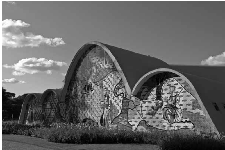
4 Church of São Francisco de Assis: street (west) elevation with azulejos by Cândido Portinari representing scenes from the life of St Francis

If the Loosian figure of the English gentleman embodied 'the truly modern style' of Apollonian Europe, Niemeyer found in the eroticised figure of the Brazilian woman of African descent, the mulata , the incarnation of the Dionysian espírito de brasilidade , which he employed to challenge the rationalist and functionalist rhetoric of doctrinaire European Modernism, and infect 'civilising' imports with what was perceived as the tropical, irrational primitive, in accordance with Brazilian Modernism's anti-colonialist Antropofagist strategy. 'My work is not about "form follows function", but "form follows beauty"', Niemeyer declared; or, 'even better, "form follows feminine".'