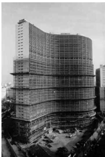
6 Edifício COPAN, São Paulo, 1953–66: under construction, 1959