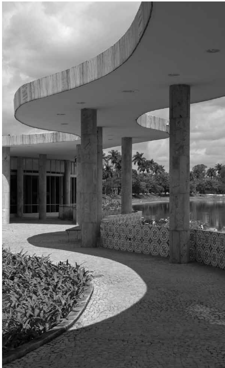
5 Casa do Baile, dance hall and restaurant, Pampulha, Belo Horizonte, Minas Gerais, 1940–43