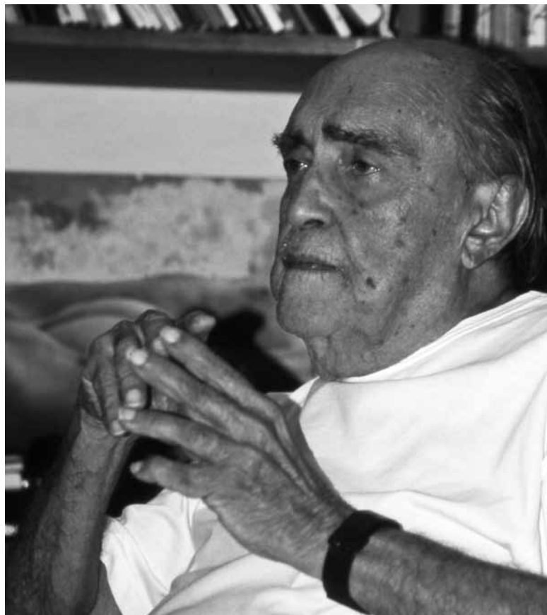
1 Oscar Niemeyer in the intimate study of his Copacabana studio, Rio de Janeiro, 2003

Born Oscar Ribeiro de Almeida de Niemeyer Soares Filho, in the hot tropical summer in Rio de Janeiro, Niemeyer frequently stressed his 'diverse ethnic roots', that is, his Brazilianness, in accordance with the national ideology of ethnic amalgamation [1]. Taking advantage of Brazil's advanced reinforced-concrete technology in the first decades of the twentieth century, and working closely with highly-committed structural engineers, he found in concrete an ideal means to achieve an architecture of 'spectacle [...] plastic freedom and [...] inventiveness' rooted in Brazil's native traditions and tropical landscape. This he imagined as challenging the dominance of clean white walls, straight lines and right angles which, for Niemeyer, 'issued from a European ethical tradition'. Motivated by a post-colonial wish to undo the image of Brazil as backward, he privileged invention and exploited the expressive