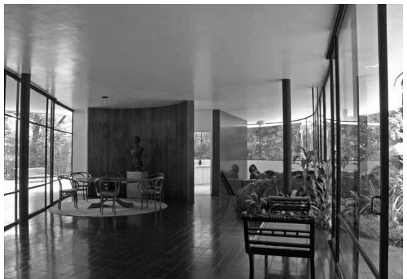
9 Niemeyer House at Canoas: view from the entrance towards the dining alcove, panelled in streaked peroba do campo, and the staircase between the green-blue kitchen wall and the granite boulder. The dining table is of Niemeyer's design (1972), and the reclining female figure at the top of the stairwell by Alfredo Ceschiatti