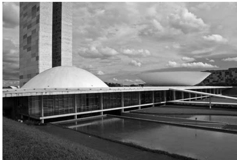
10 Congresso Nacional (National Congress) with the shallow dome of the Senate partnered with the inverted larger dome of the Chamber of Deputies and the twenty-seven-storey twin towers of the Secretariat, Praça dos Três Poderes (Square of the Three Powers), Brasília, 1958–60

During the years when Niemeyer was forced into exile by Brazil's military dictatorship, which came to power in 1964, he exploited