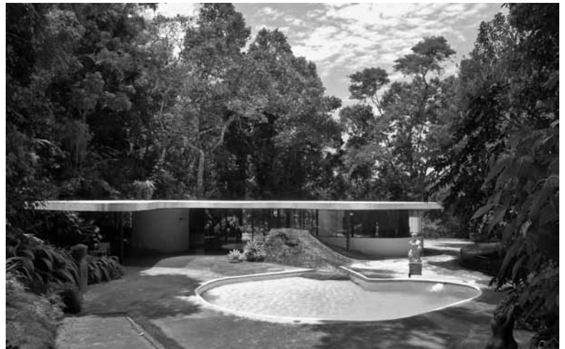
8 Niemeyer House at Canoas (Casa das Canoas), São Conrado, Rio de Janeiro, 1950–53: view of the pavilion from the ramp that descends from the entrance gate towards the house set in what appears like a clearing cut into the mountainside